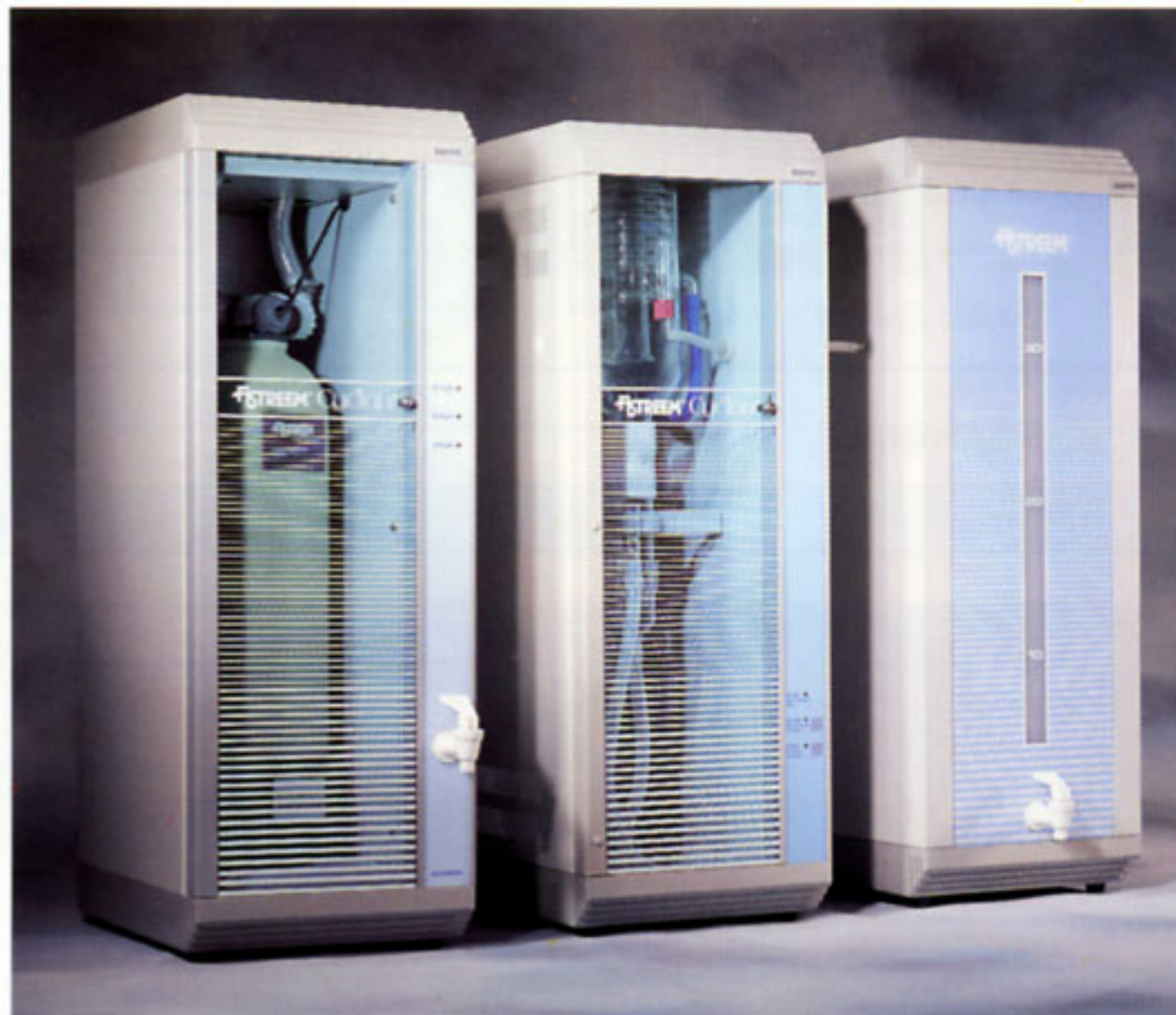
Deioniser, 4 l still and reservoir

All Cyclon Stills are supplied with accessories which enable the user to adapt from tap feed to treated feed